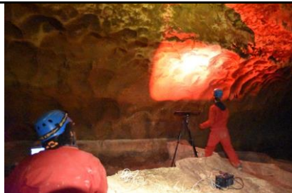
Cave Saint Marcel, Ardèche

In this internship, the student will develop in the group, one or several model experiments, reproducing dissolution erosion phenomena. To decrease the timescales, fast dissolving materials like salt and plaster will be used. Hydrodynamic properties of the flows will be characterized and the 3D shape evolution of eroded surfaces will be recorded. Several experimental projects are possible, depending on the water flow configuration (thin film, turbulent current ...).