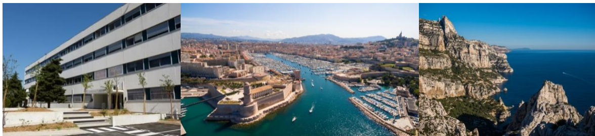
Left: the Fresnel Institute (30 minutes by bike or public transportation from the city center); Middle: the city center and old harbour, heart of Marseille; Right: the calanques, less than an hour by public transportation from the city center

On top of a thrilling research environment, the city of Marseille offers a high quality of life, with limited living costs and a unique combination of a culture and nature.